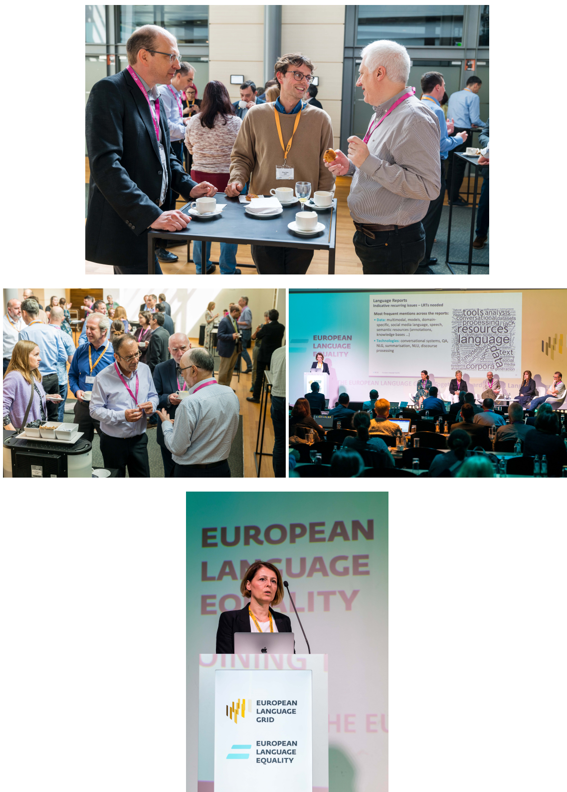
Figure 5: META-FORUM 2022 – Photo gallery 2/2