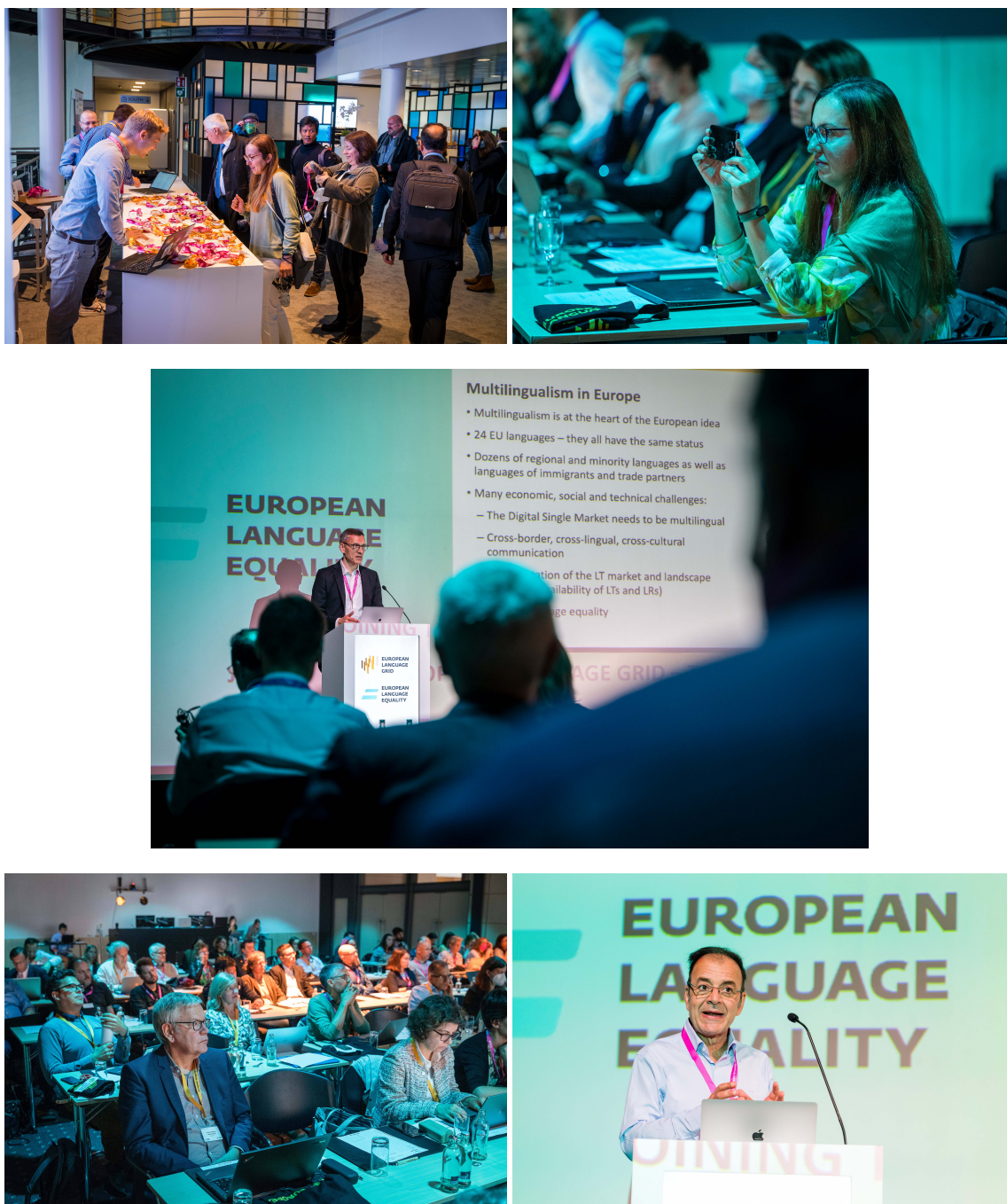
Figure 4: META-FORUM 2022 – Photo gallery 1/2