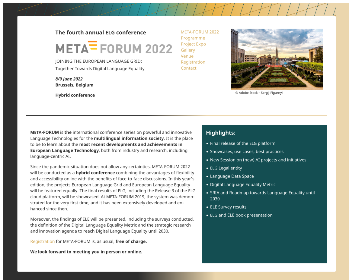
Figure 1: META-FORUM 2022 website

regarding the future development after the completion of the project was another focus of the programme.